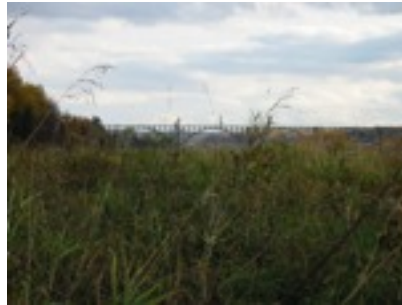
The Hugh John Flemming Bridge from different angles at the waterfront