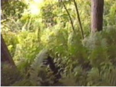
In 2000, Lester scouted out a pathway to the waterfront which used to be an old farmroad but could barely be walked on.

We are very lucky to have a farm that borders on the beautiful Saint John River. We can go on many adventures here