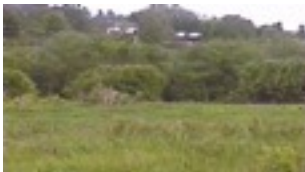
Views of the farm from the waterfront in Spring and in the Fall