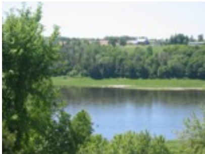
Can you see them??

They had so much fun that they forgot to stop paddling once they hit land!!!