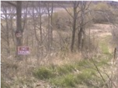
By 2001, we have a road way built.