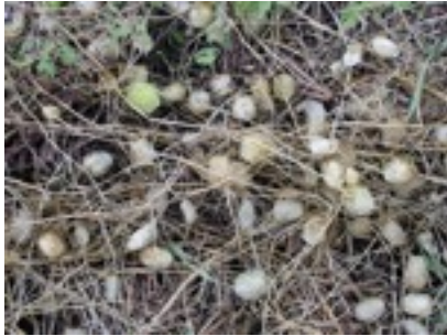
Wild cucumber vine