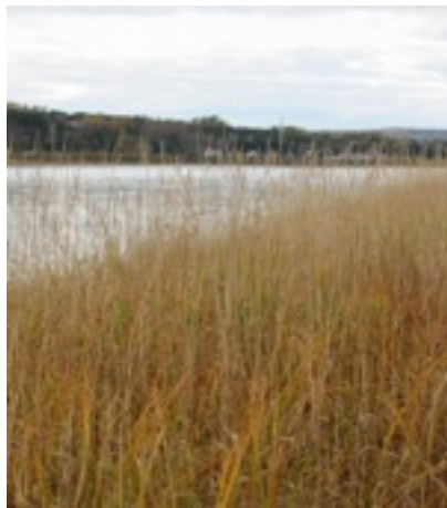
Fall river grass

They had so much fun that they forgot to stop paddling once they hit land!!!