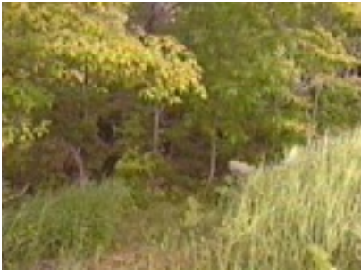
With his trusty bush wacker—down he goes to blaze a trail (at 81 yrs old)